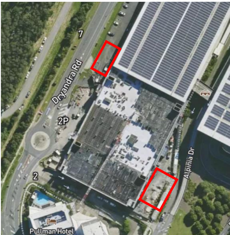
Figure 1: Impact locations