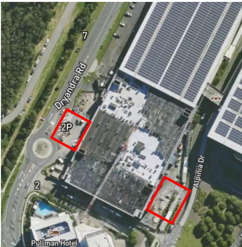
Figure 1: Impact locations