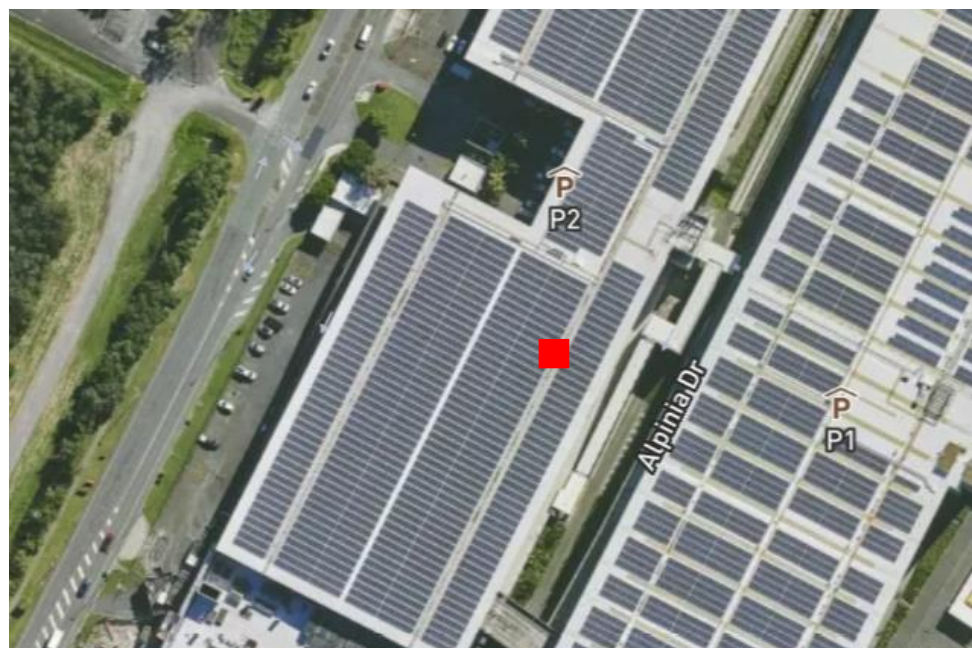
Figure 1: Impact locations