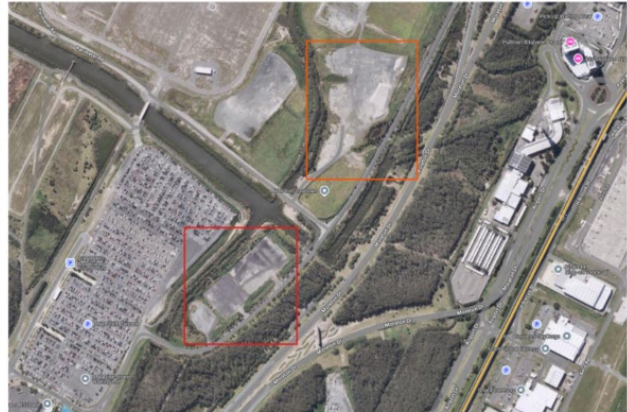
Location 2 Stockpile Location