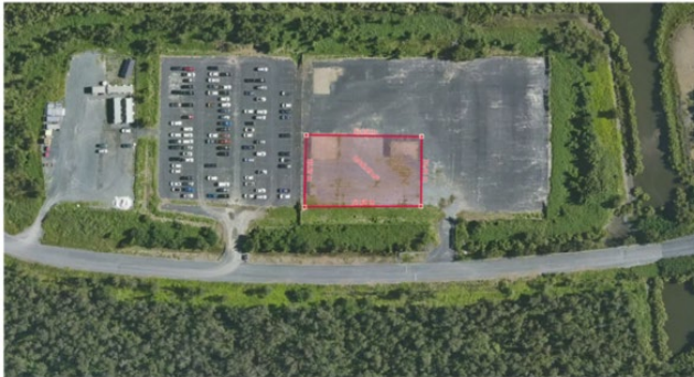
Location 1 Stockpile Location